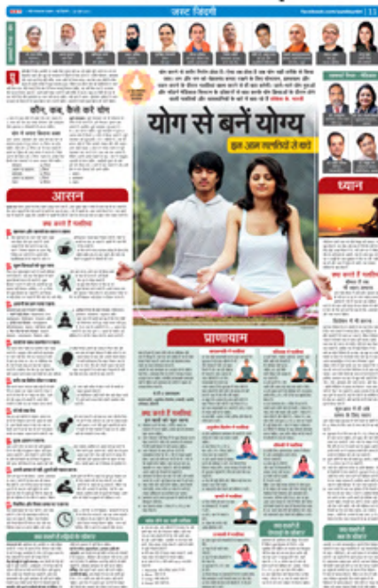
(20 th June, 2021)