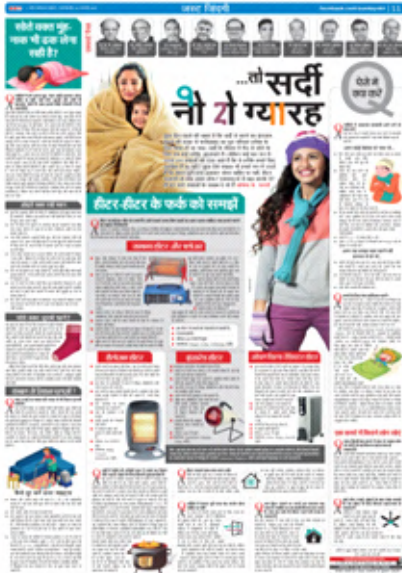
(24 th January, 2021)